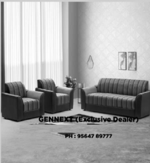
LECO SOFA SET (3+1+1 Seater) NOW ₹43,000 ₹47,000

LIVING, STUDY AND OFFICE, DINNER SETS, RECLINER, FURNITURE, MATTRESS, BEDROOMS.