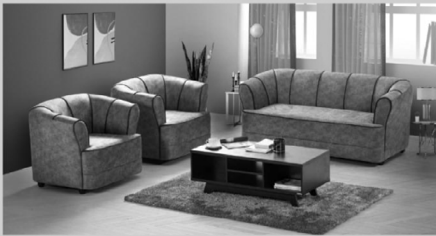
CRISLAN SOFA SET (3+1+1 Seater)