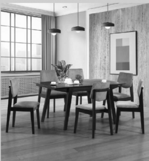
ATLANTA 6 Seater Dining Set NOW ₹42,750 ₹57,000