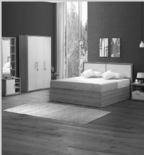
RICKY 4 Piece Bedroom Set NOW ₹73,000 ₹80,700